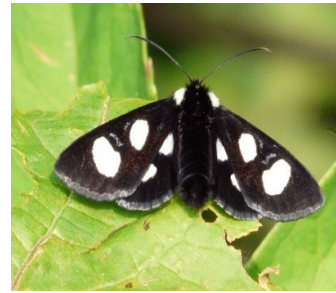
Eight Spotted Forester Moth

I like to eat Queen Anne's lace (also known as wild carrot), and I spend the winters safe in my chrysalis. As an adult I am a striking individual, with dark formal attire and tails, although my yellow cousin is more common