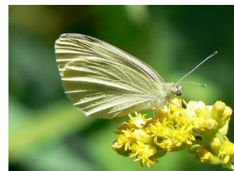
Cabbage White Butterfly

I can be found on the grape leaves and virginia creeper, as an adult I am not the best flier, so I only fly during the day