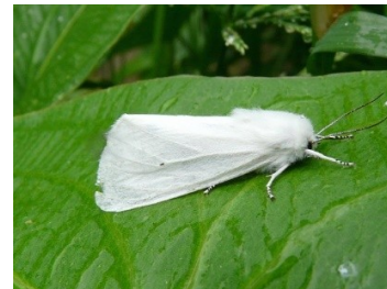
Virginia Tiger Moth

I like to eat cabbages and members of the mustard family. I am a smaller, not so colourful butterfly, but I can be often found in the city and in meadows